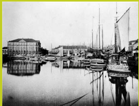
Photo of Carondelet Basin, ca. 1895

The Lafitte Corridor has been a significant transportation route since the founding of New Orleans. In 1794 the Carondelet Canal was completed (located in the stretch of the Lafitte Corridor from Bayou St. John to Basin Street) to provide a small but critical waterway for commercial ships entering New Orleans via Lake Pontchartrain and Bayou St. John. The Southern Railway constructed a rail line adjacent to this Canal in the early 20th Century. Passengers entering New Orleans on the Southern Railway disembarked at the terminal building located at Canal and Basin Streets. Today, the land is largely abandoned and there is pressure to develop it from many interests.